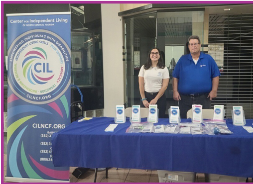
CIL staff tabling at the Citrus County Hurricane Expo