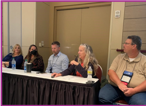
CIL staff presenting on a panel at the Governor's Hurricane Conference