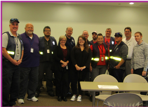
FEMA and CIL staff working together to help the community.

CONTACT US TODAY TO LEARN HOW YOU CAN HELP OR HOW WE CAN HELP YOU!